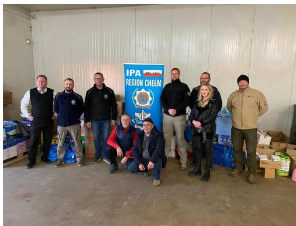
Handover to IPA Ukraine

I don't want to imagine what was going through people's minds as they got further and further from home minute by minute. Our journey led via Katowice to Dresden, and from there to Frankfurt.