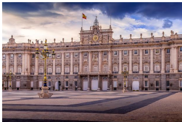
... as well as the capital Madrid!

In Toledo we will take a half-day guided tour to visit this monumental World Heritage city, the capital of the Spanish Empire under Carlos V. The visit to the medieval city of Avila will impress you, due to its magnificent city walls. We will also visit the National Police Academy (CNP).