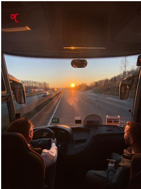
IPA on the move: Ukraine aid convoy eastward-bound

In order to provide the refugees with relief supplies, committed IPA friends became active and put together relief transports, which were initially financed by the German IPA Section and then became more and more extensive through a variety of donations.