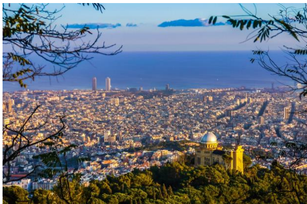
Look forward to visiting beautiful Barcelona ...

For those of you who want to take part in the Friendship Week after the World Congress, I assure you it will be amazing. Colleagues from IPA Madrid and the IPA Catalunya region have prepared a programme that you will not forget for years to come. You will be accompanied 24/7 by members of the organising committee.