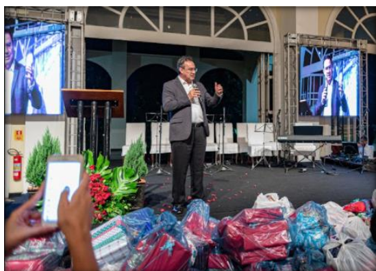
Dr. Augusto Cury

This year, IPA Brazil included a charity dinner in the project. The highlight of this event was a lecture by renowned writer Augusto Cury, and a musical performance by the Suzuki Music School, plus sopranos, tenors, and baritones, in addition to renowned instrumentalists and pianists. During a solemn moment, he carried out the symbolic delivery of the gifts to the leaders of the Brazilian Postal Service, Correios do Brasil, for the purpose of home delivery, and to the managers of the chosen entities. But it did not stop there, as the children's gifts were also delivered by IPA Brazil's Father Christmas, Papa Noel, and his assistants, directly to the children in day care centres, orphanages, schools and the indigenous community.